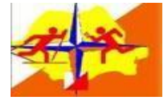
Romanian Federation of Orientation